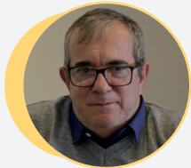
Rodrigo Londoño Echeverri